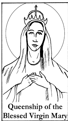
Queenship of the Blessed Virgin Mary

“Very truly, I tell you, unless you eat the flesh of the Son of Man and drink His blood you have no life in you”. Are you being chosen to give life to His people as a priest, deacon or in the consecrated life? Call the Office of Vocations (717) 657-4804 ext. 282, or email frrlavoie@hbgdiocese.org .